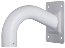
ADBK01W Wall Mount