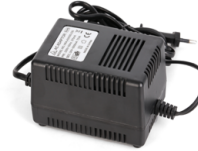
AC24V/3A Power Supply