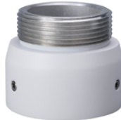
ADMA01 Mount Adapter